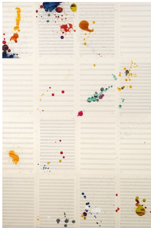
Giuseppe Chiari, Colori , 1974. Mixed media on staff paper on canvas, cm 132 x 115.5 / in 52 x 45.5.