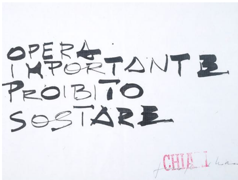
Giuseppe Chiari, Opera importante, 1990. Ink on paper, cm 30 x 42 / in 11.8 x 16.5.

10 Jul — 30 Sep 2015 at Tornabuoni Art Gallery in Paris, France